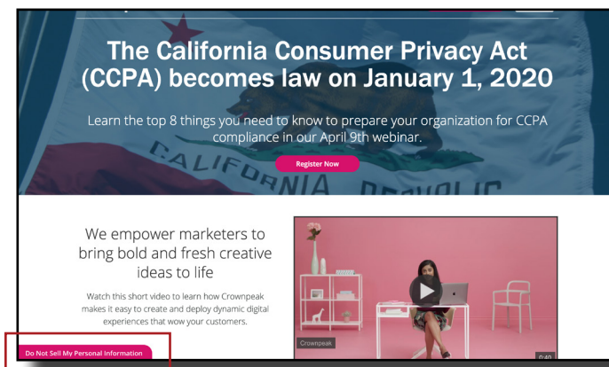
Floating button to show “Do Not Sell My Information” link on an infinite scroll page