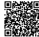
FirstSpirit AI Suite

Start by enabling the FirstSpirit AI Suite or any individual assistants you want to use. If you have configuration access, follow instructions to begin customizing prompts directly in the ContentCreator.